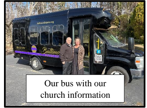
Our bus with our church information

On Sunday, February 5 th , after our morning service we visited a local church building that we are looking at with the hope of potentially purchasing it. This process is in the very preliminary stages. The congregation that meets there currently plans to move to the suburbs. They would like to see the building continue to be a church. Please pray that the Lord gives us the favor, freedom, and funds to acquire this building if it is His will.